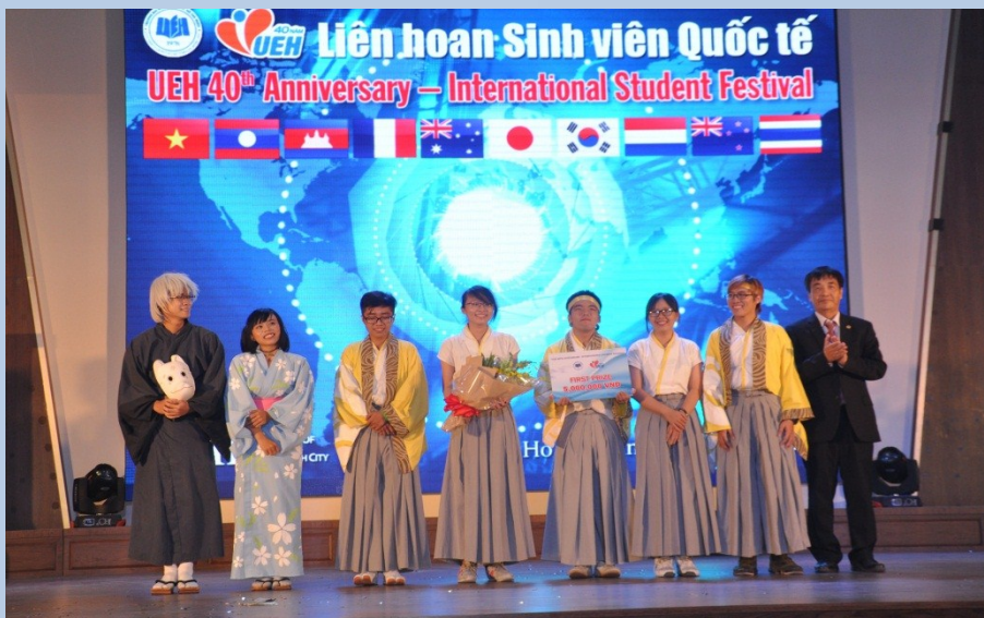
Welcome international students

It was successfully held with the participation of 10 countries including France, the Netherlands, Australia, New Zealand, Japan, Korea, Thailand, Laos, Cambodia and Vietnam. In order to introduce the different cultures and the countries' own characteristics, the students set up booths which presented the 40 years of partnership with UEH. One of the major highlights was the art performance of each nation to promote its culture.