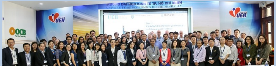
Group photo of all the participants at the 1 st ASIA-PACIFIC INFINITI Conference