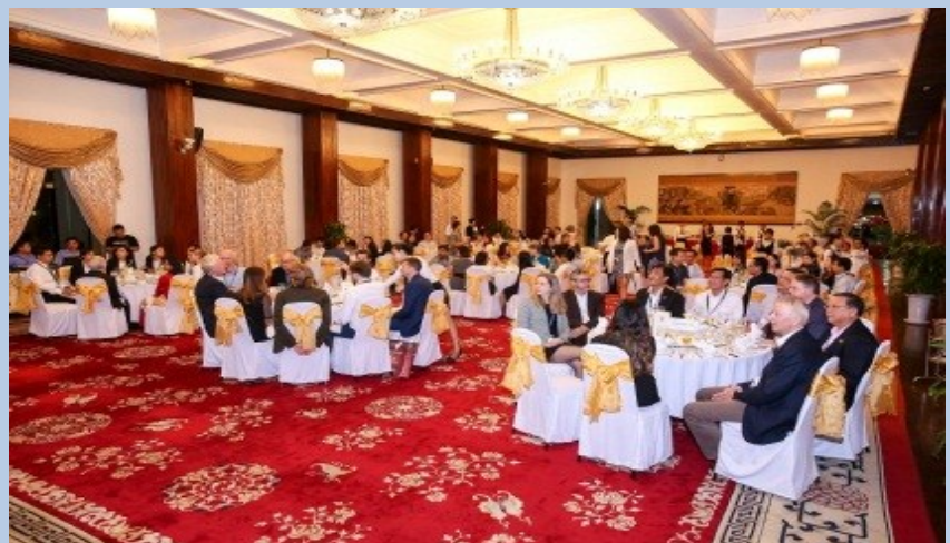
Gala Dinner at the Reunification Palace in HCMC