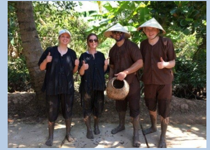
Trip to the Mekong Delta

“University, classes, firm visits and students from Bell Club, at every turn we have been greeted with enthusiasm, warmth and kindness.”