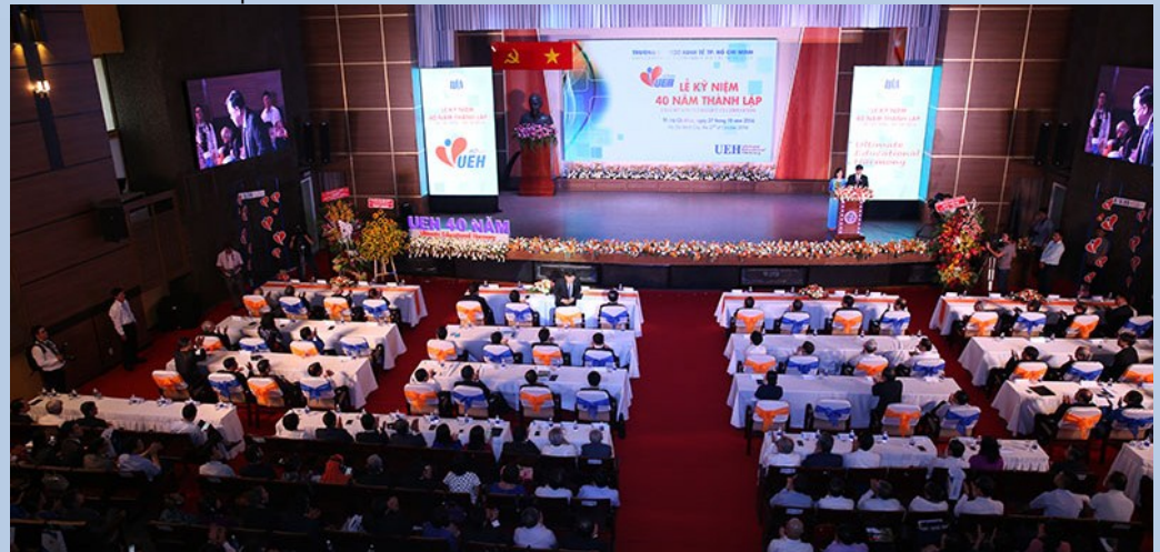
UEH 40 th Anniversary at Hall 116, UEH Campus A

During the ceremony, the story about the last 40 years was told by several video clips which emphasized the successful outcomes of many generations of teachers and students. In recognition of UEH's local and global contribution to the development of society, UEH was awarded the "flags of honor" by Central Government and HCMC People's Committee.