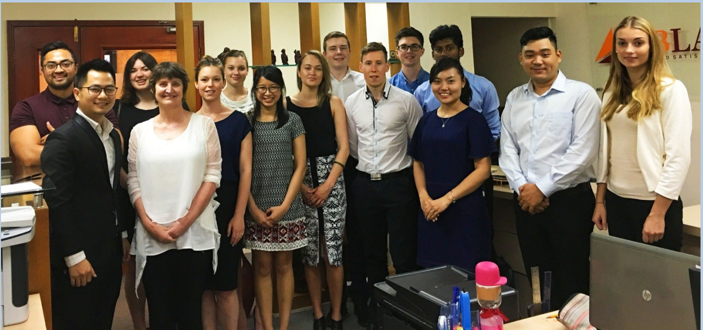
At one of two international law company visits