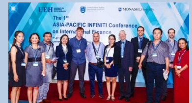
Welcoming to the Gala Dinner