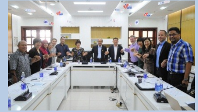
During the meeting

Due to the development of SALT association, the agenda contained mainly organizational and administrative issues such as the SALT Organization Structure, Conference's Organizing Committee etc. which led to many innovative ideas and results.