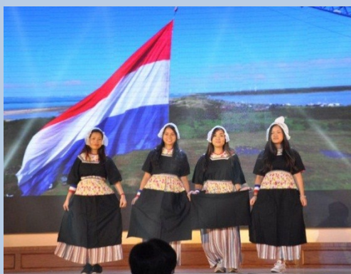
Traditional Custom Performance