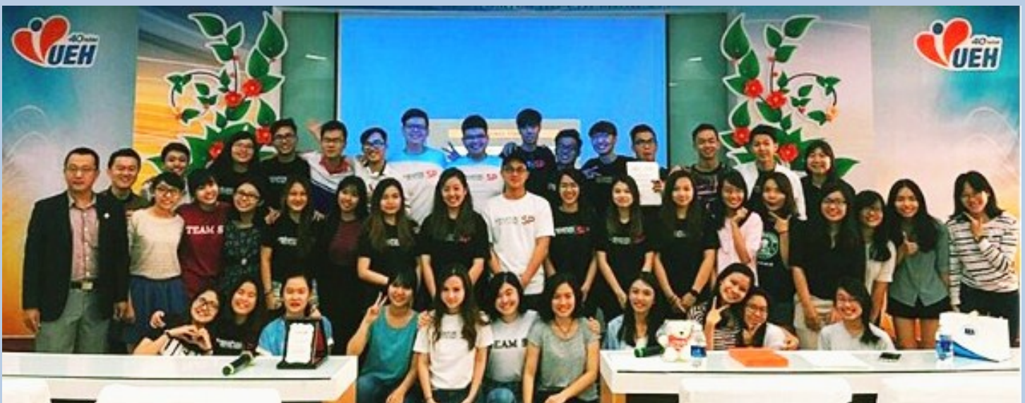
Farewell party with UEH's students and Head of IRO