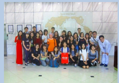
At Yakult Co. Ltd

Besides learning about current affairs, the students also learned about the past of Vietnam by visiting historical monuments such as the Reunification Palace.