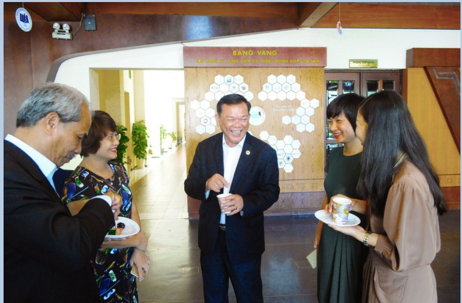
During the tea break time