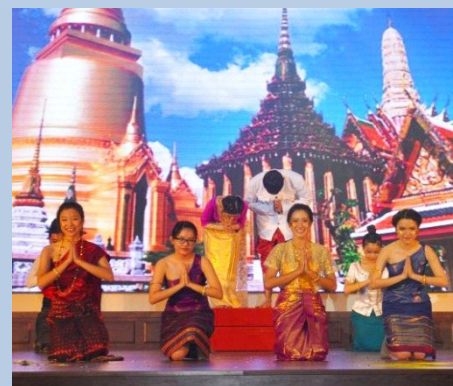
Traditional Dance Performance