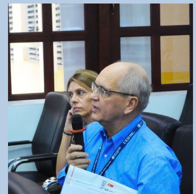
Researcher asking the Board of Editors for publishing at Workshop

In the evening, all the participants attended the Gala Dinner which took place in the Reunification Palace, a historical monument which symbolizes the culmination of the Resistance War in 1975.