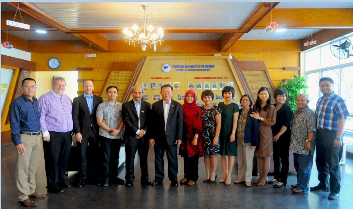
Group photo of all the SALT members