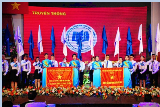
Receiving flags of honor by Central Government and HCMC People's Committee

During the ceremony, the story about the last 40 years was told by several video clips which emphasized the successful outcomes of many generations of teachers and students. In recognition of UEH's local and global contribution to the development of society, UEH was awarded the "flags of honor" by Central Government and HCMC People's Committee.