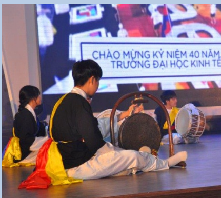
Traditional Art Performance