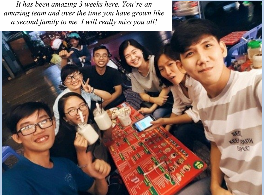
Ho Chi Minh City by night

It has been amazing 3 weeks here. You're an amazing team and over the time you have grown like a second family to me. I will really miss you all!