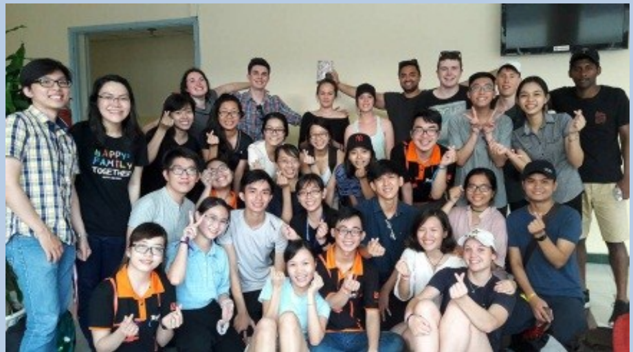
Group photo of Waikato University and UEH students