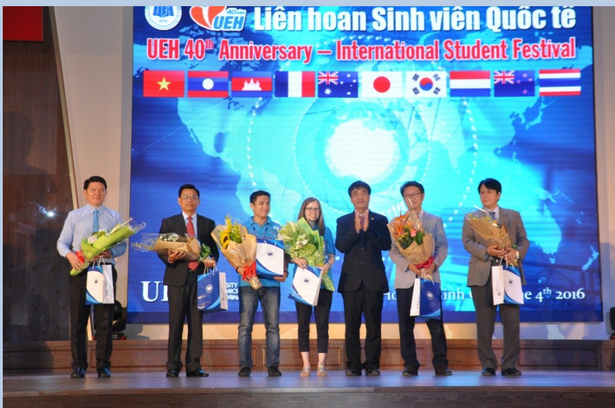
Welcome Representatives from Consulate General

UEH is striving to strengthen the solidarity and the pride of its students as well as its personnel to enhance the cooperation with local and international organizations. Throughout the series of activities UEH insisted on the strength of a leading university in Vietnam, reaching international level. UEH has developed over a long period of time and wants to continue to grow further in the future by means of cooperation with its partner universities.